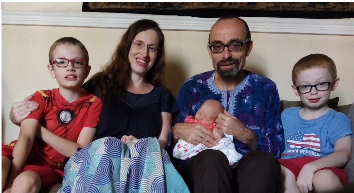
First family portrait!