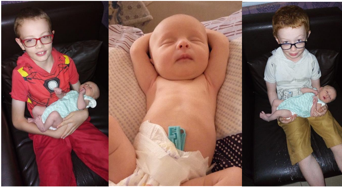
Chillin' with her big brudders!